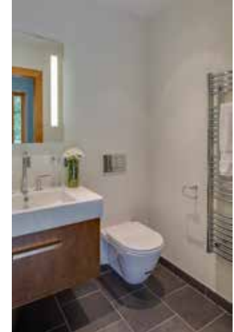
ABOVE: The floating vanity and toilet further this bathroom's modern style, and the towel warming rack is another amenity that add to this bathroom's appeal.