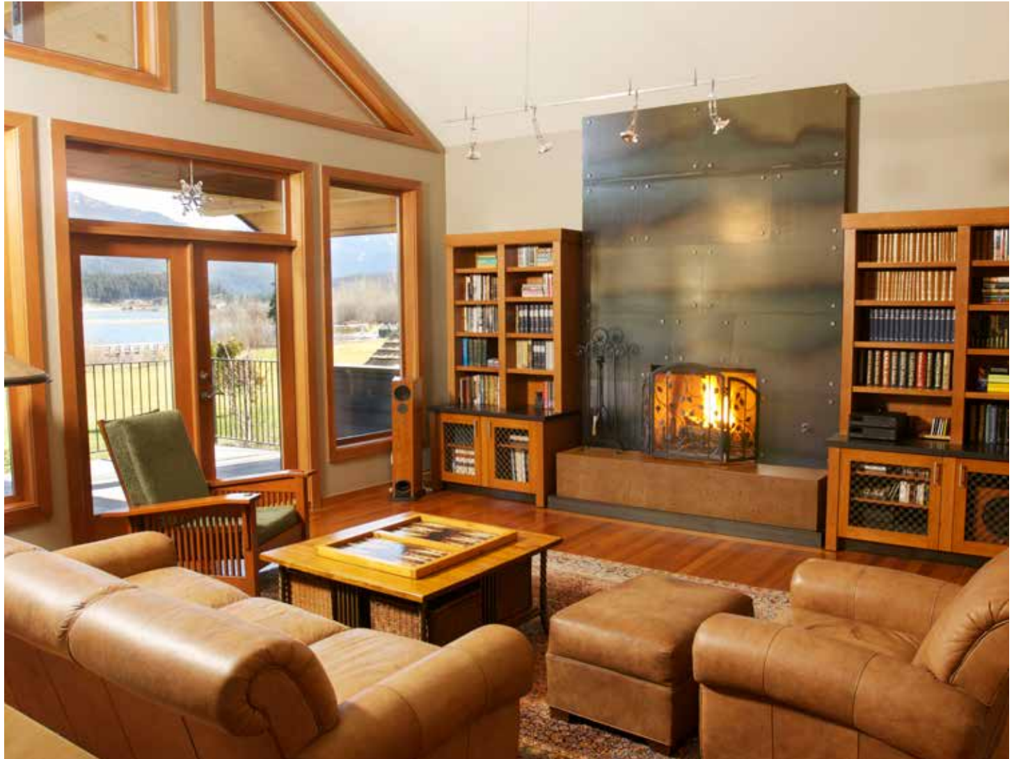
ABOVE: Choosing a fireplace that will work for you is easier than ever. Choose between gas, electric, or wood-burning. Would you like it to look modern or rustic? Do you want it to be a heat source or decorative? Pick a design that complements your entire living space.

Consider including a fireplace that can serve as the main attraction of the room.