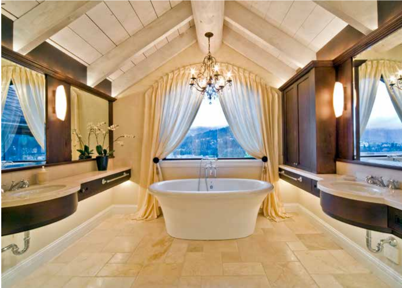
ABOVE: This luxury tub is not only a welcome destination after a long day, but also boasts amazing panoramic views of the surrounding mountain range.

If you have a large footprint for your bathroom, consider a standalone tub that can be the focal point of the room as well as a place to relax after a long day.